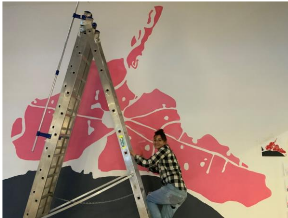
Lluïsa Penella during the process