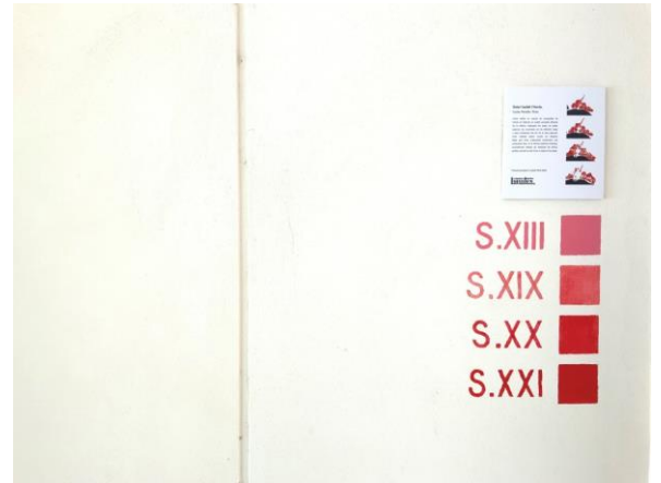
Legend to understand the expansion of the city of Valencia at the expense of the disappearance and fragmentation of the adjacent Garden