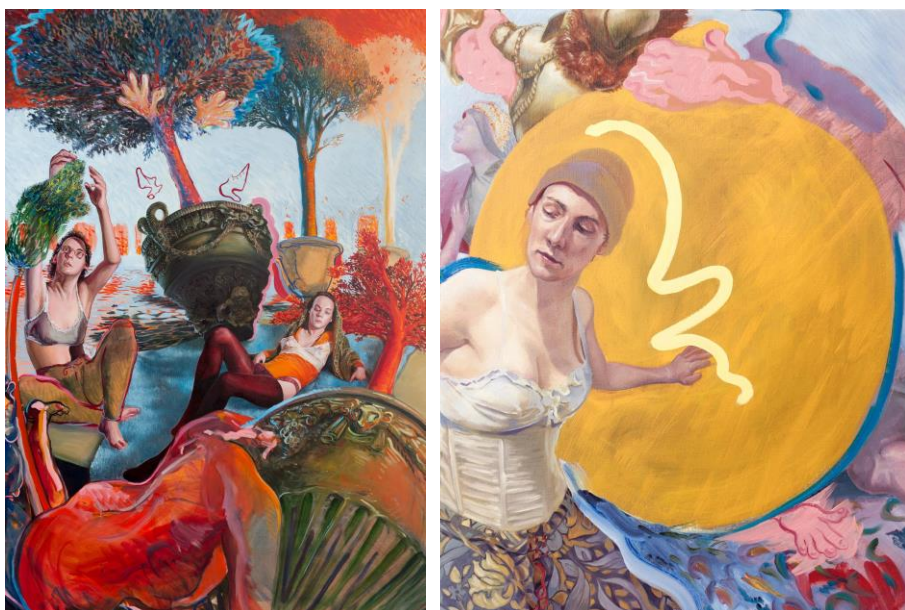
Left : Susanne et les Vioques (2018), Right : Le Petit Citron (2018)